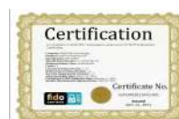
FIDO L1 UAF & FIDO2 Authenticator FIDO 等級一 UAF & FIDO2 安全金鑰認證

FileAegis 是新一代資料交換系統，為了滿足企業在資料共享與協作的資安需求。其技術取得 FIDO 聯盟無密碼身分登入國際認證，NIST 合規加密密碼演算法，還具備中心化管理以及獨樹一幟的資料協作機制。匯智安全科技旨在革新企業資料交換及傳輸的常規，建立兼顧安全與效率的作業平台。