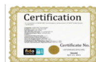
FIDO L1 U2F & FIDO2 Authenticator FIDO 等級一 U2F & FIDO2 安全金鑰認證

FileAegis 是新一代資料交換系統，為了滿足企業在資料共享與協作的資安需求。其技術取得 FIDO 聯盟無密碼身分登入國際認證，NIST 合規加密密碼演算法，還具備中心化管理以及獨樹一幟的資料協作機制。匯智安全科技旨在革新企業資料交換及傳輸的常規，建立兼顧安全與效率的作業平台。