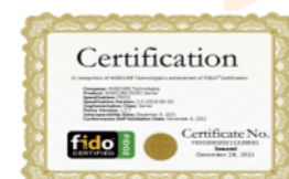
FIDO2 Server FIDO2 伺服器認證

WiSECURE Technologies is a crypto-based security company. At an advantageous stance in the academic and technological fields, WiSECURE is leading in post-quantum cryptography and passwordless strong authentication.